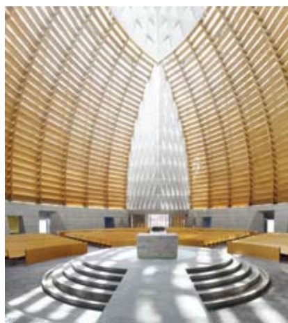
Cathedral of Christ the Light, Oakland

See the centerfold for a map of where the courses are held.