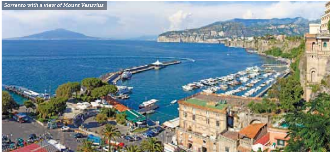
Sorrento with a view of Mount Vesuvius

"Like" us on Facebook at facebook.com/CalDiscoveriesTravel