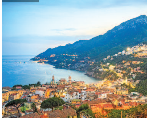
Vietri sul Mare