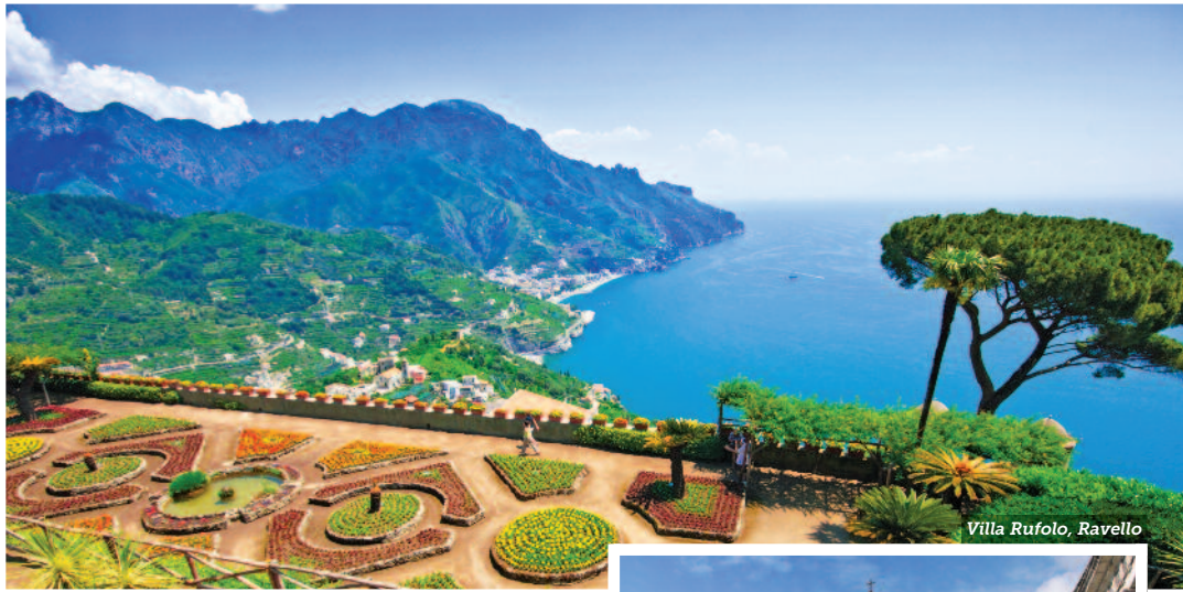
Villa Rufolo, Ravello