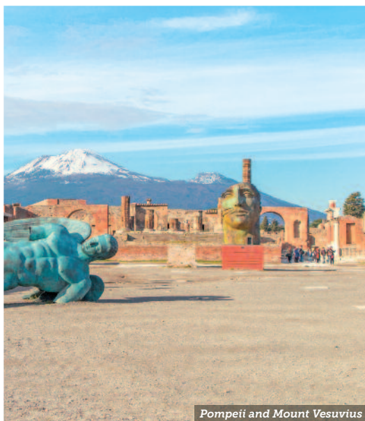
Pompeii and Mount Vesuvius

a celebrated resort since the time of the Roman Republic. Ride to the top of Anacapri to see incredible views, and learn why Capri is “a piece of paradise fallen from the skies.”